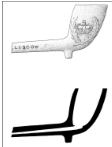
Fig. 12: Pipe bowl with crown and oak leaves by White, Glasgow (1806–1891). H. 38 mm, dia. 16 mm. #924/cat. no. 6252.