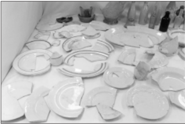
Fig. 3: Ceramics from the main rubbish dump, 850. These include quantities of heavy utilitarian earthenwares, banded whitewares. Note the stout bottles at the rear.