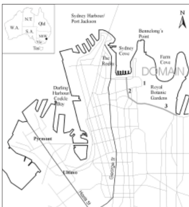
Fig. 1: Location plan. 1. Conservatorium of Music; 2. First Government House; 3. Approx. position of 1792 Domain boundary.

The residence of the Governor of New South Wales, Government House, Sydney was completed sufficient for occupation by Governor Sir George Gipps and his wife in June 1845, shortly prior to his return to England. The Governor of New South Wales had considerably more