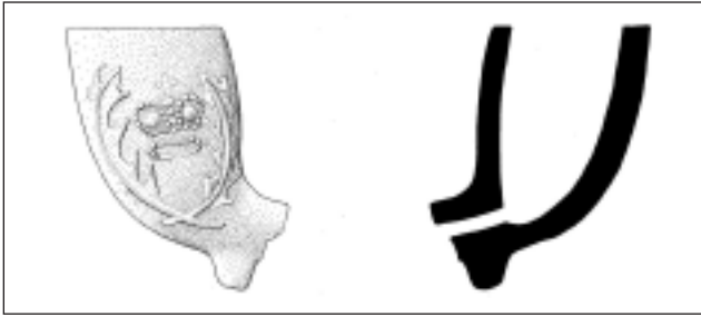
Fig. 11: Pipe bowl with crown and oak leaves. H. 38 mm, dia. 16 mm. #924/ cat. no. 6251.