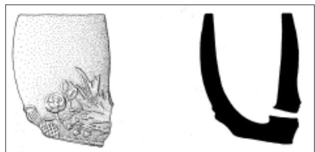
Fig. 10: Pipe bowl with rose, thistle and four-leaf clover. Remains of pale pink colouring. H. 32 mm, dia. 17 mm #924/cat. no. 6250.

Other than the 17 clay smoking pipes from the rubbish dump there were few indications of artefacts associated with recreational activities in the main dump. Remains of 32 pipes were found in the area of the western garden beds (Figs 10–12). Some of the pipes are interesting as they exhibit the symbols of the United Kingdom, the rose, thistle and four-leaf clover, as well as two with the royal crown symbol. It is notable that three of these pipes with royal symbols or the symbol of Great Britain with the rose, thistle and four-leaf clover, came from the same deposit, context 924. These pipes may all have been thrown out at the same time, possibly coming from the Mess Room of the Governor's orderlies who were located within the southwestern rooms of the stables from the 1850s.