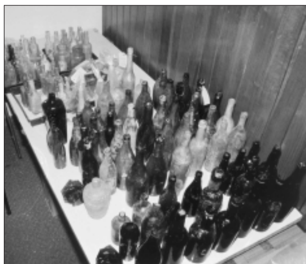
Fig. 6: Alcohol bottles from context 850.

... all impressed marked examples being of Scottish manufacture and all based in Glasgow. The most commonly represented is H. KENNEDY/BARROW-FIELD/POTTERY/GLASGOW (1866–1929) (41), followed by PORT DUNDAS/GLASGOW /POTTERY COY (c1850–1930) (11), with a few examples each from MURRAY & CO/GLASGOW (1870–1898) (3) and GROSVENOR/GLASGOW (c1869–1926) (3). Stout appears to have been consumed on site in large quantities from the mid-nineteenth century onwards. (Ward 2002)