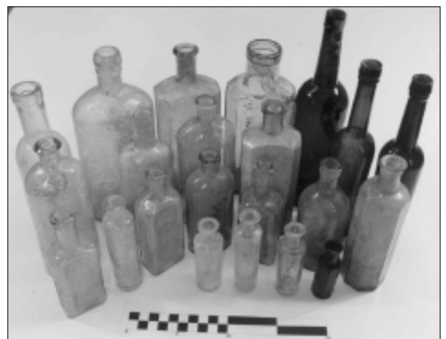
Fig. 7: Range of pharmaceutical and patent medicine bottles found in the main rubbish dump.

These products were often seen as a panacea for all ills; they frequently contained alcohol and were often specifically marketed at women (Fitzgerald 1987:191). These 'medicines' also contained morphine or cocaine. The recommended uses for some of the items found at the site are fascinating, such as Henry's Colonial Ointment reputedly used to cure eruptions, sore heads, inflamed eyelids, blight ulcerated legs, tender nipples and bad breasts; apparently it was highly efficacious. Other items were intended to aid in the restoration of hair. The presence of so many of these items illustrates how some members of the household had a certain amount of disposable income to purchase these more expensive items and that issues of appearance and health were important to the residents of Government House. While categorised as pharmaceuticals many of these items were associated with people's individual appearance and their health and fall mostly into the patent medicine group. Analysis from another site, the Red Cow Inn, Penrith, noted that all patent medicines were from the USA, not from France or Britain (Harris 2005). The different purchase pattern at the Conservatorium Site may relate to the