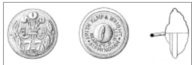
Fig. 9: Officer's button from the 77th Regiment. Dia. 24 mm. #720/cat. no. 6158.