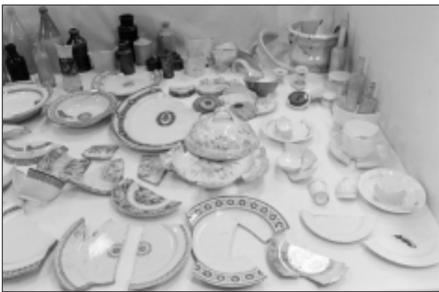
Fig. 4: Artefacts from the main rubbish dump, purple, blue and green transfer printed vessels and gilded bone china cups and saucers with other items from the rubbish dump.