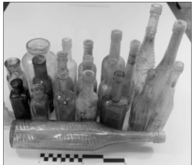
Fig. 5: Mainly food-related bottles, notably oil and vinegar from the main rubbish dump, 850.

Serving vessels were found in eleven different decorative wares (Casey & Lowe 2002: Appendix B, Table 850.6). Most